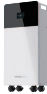
Fidus Battery Plus